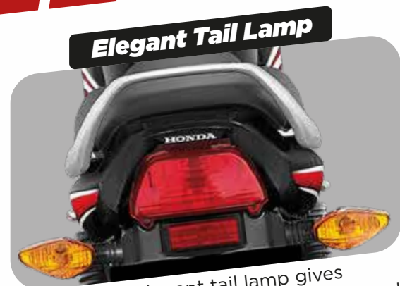
Elegant Tail Lamp Bright and elegant tail lamp gives the bike an imposing look from the back.